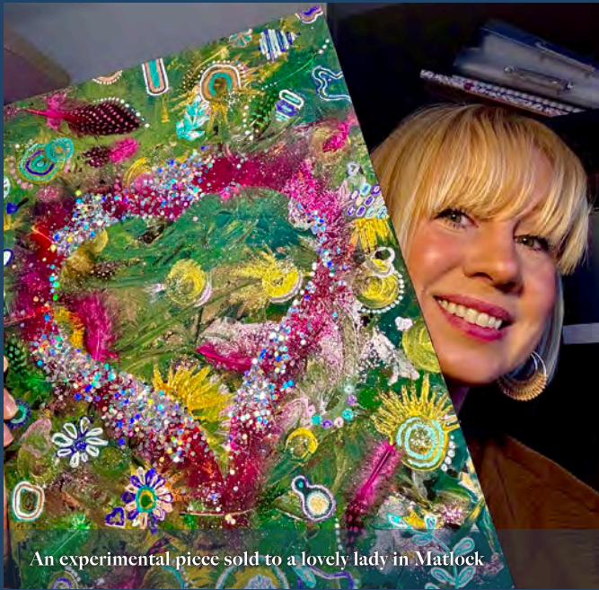
An experimental piece sold to a lovely lady in Matlock

I am excited to introduce you to my art, which embodies "Positive Mental Artitude", a phrase I've coined to reflect the fusion of creativity and optimism that drives my work. Each brushstroke, whether in traditional or digital medium, is placed with the intention of uplifting the spirit and fostering a positive mindset.