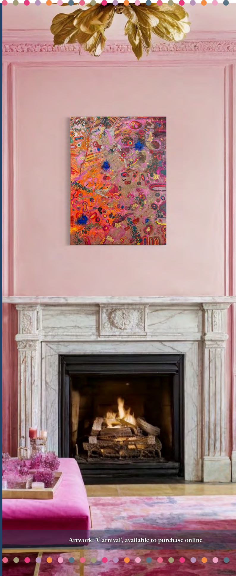
Artwork: 'Carnival', available to purchase online