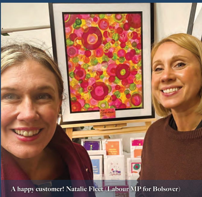
A happy customer! Natalie Fleet (Labour MP for Bolsover)

For me, creating art is not only a personal journey of peace and relaxation, but a way to channel that same sense of well-being into the lives of others.